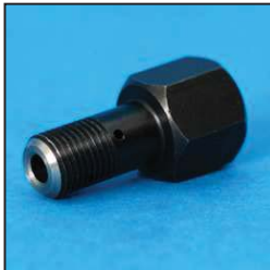
AAZ034-07 Adaptor pressure sensor DELPHI