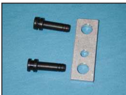
AAZ026-03 Kit flange and connections for CP1 Mercedes pump