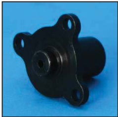
AAZ034-15 Adaptor pressure sensor CP1H/CP3