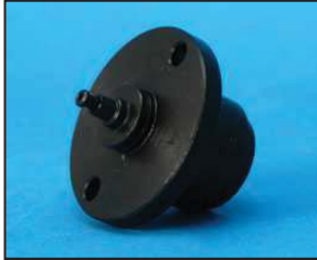
AAZ034-19 Adaptor pressure sensor SIEMENS pump