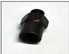
AAZ034-CP4 Connection to fix high pressure pipes on CP4 pumps