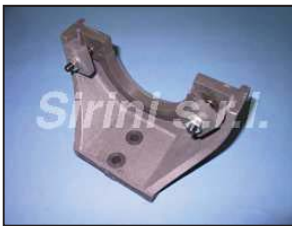
AS0003-00 Bracket Bosch ISO Similar: 1.688.010.124