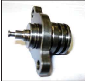
AAZ034-13 False pressure regulator for CP1 pump