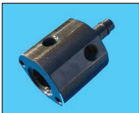
AAZ034-22 False pressure regulator for Denso HP3 – CP3 pump