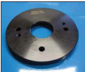
AAE001-CP4 Bracket for CP4 pump