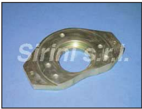
AAE157-08 Bracket diam 50 for CP1 pump Similar: 1.685.720.062