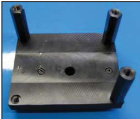
AAE002-CR Bracket for Nissan Qashqai pump