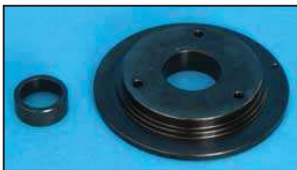
AAE001-03 Bracket with ring for CP3 pump Mercedes