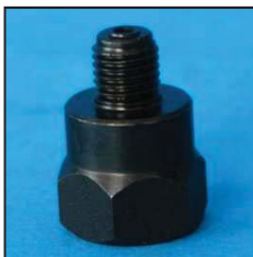
AAZ034-20 Adaptor pressure sensor SIEMENS - BOSCH