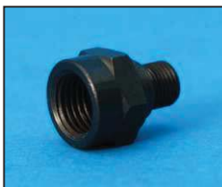
AAZ034-17 Adaptor pressure sensor DENSO