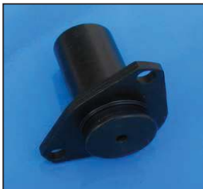
AAZ034-21 Connection for pressure Siemens with supply valve