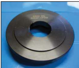
AAE001-CP1H3 Bracket for CP1 H3 pump