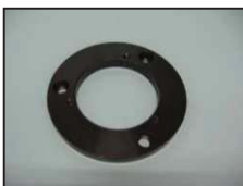
AAE001-MERC Bracket for CP1 Mercedes pump