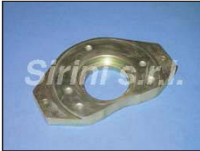
AAE000-04B Bracket for Delphi pump with holes