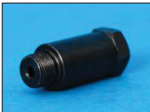
AAZ034-16 Adaptor pressure sensor SIEMENS