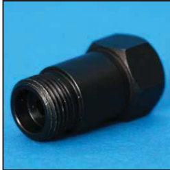
AAZ034-08 Adaptor pressure sensor CP3