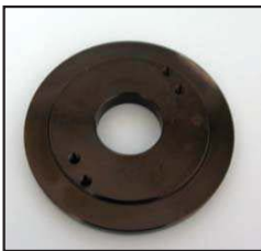
AAE001-NIP Bracket for common rail Denso HP2/3 pump on Ford and Fiat