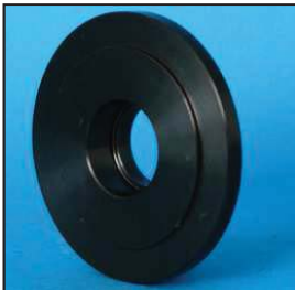
AAE001-02 Bracket for CP3 pump