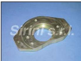
AAE000-04 Bracket for Delphi pump on Ford and Renault Megane