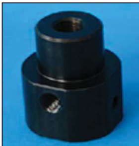
AAZ034-18 Connection to fix high pressure pipes with Siemens pump